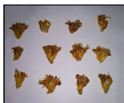
Figure 9 Dehydration of Pineapple Figure 10 Dehydrated Pineapple