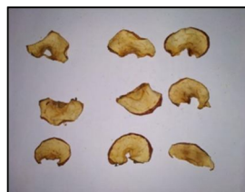
Figure 6 Dehydrated Apple