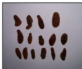
Figure 4 Dehydrated Grapes